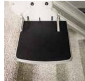
Not all options are shown.

Request a four-point harness for additional securement points on the chair.